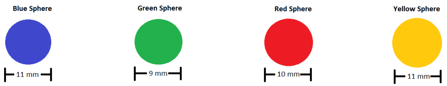
Figure 2: This are the diameter of Water Beads Pearls d'eau (Water Gel crystals) that were placed in the milk.