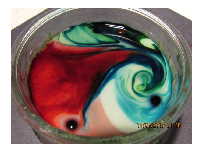
Figure 6: Original picture (size 4608 X 3456)

Figure 5 is the original photograph without any photo processing that shows more of the flow due to the surface tension and vortex pairing phenomenon. As you can see on Figure 4 from the time stamp you only have a few seconds until the fluid flow changes once again.