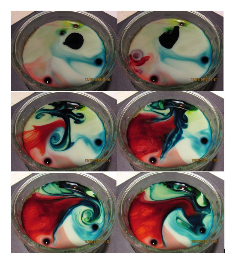
Figure 4: time laps of the fluid over a minute

Figure 4 is where the initial blue dye propagates, moving away from the blue sphere due to the soap that was put on it reducing the surface tension. In the second picture down to the left on Figure 4 you can see more clearly the vortex pairing once the force was applied. Going on the second picture down to the right you see how quickly the flow dispersed, but it continues to be pushed away from the blue sphere.